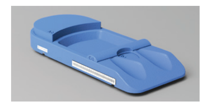
BB09-D Koilia Mikros Belly Board Includes modules: A-1 A-2 B-1 C-1 D-1

Soft without any hard edges, for ultimate patient comfort